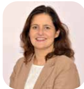
Senator Catherine Ardagh