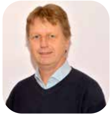
Seamus Doyle Chair